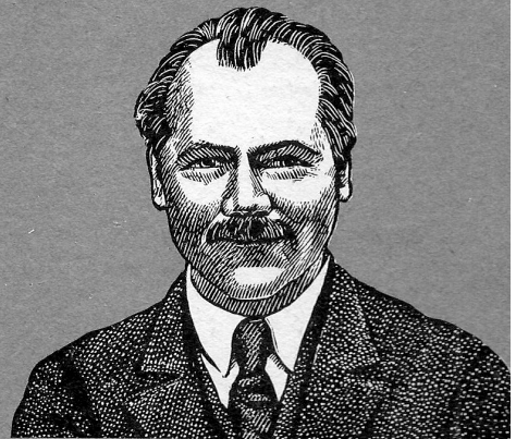
Fig. 5: Vavilov in 12 th grade textbook (1965)

Genetiker; befaßte sich mit der Erforschung von Entwicklungszentren der Kulturpflanzen, der Theorie der homologen Reihen und mit Problemen der Modifikation und Mutation. Große internationale Anerkennung fanden seine Arbeiten über Immunitätsprobleme und über die theoretischen Grundlagen der Selektion.