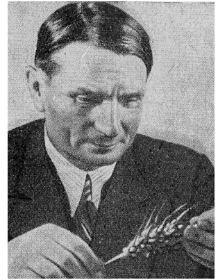
Fig. 4: Lysenko in 12 th grade textbook (1925)